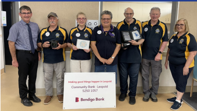
Above: Members of the Leopold Lions Club's vision screening team.

For more details on how to become a LEHP Vision Screener go to lehp.org.au/cvsp-training-courses or email training@lehp.org.au